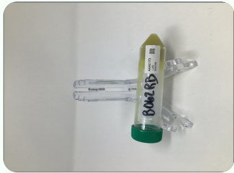
The photos on this report are of a sample collected by the lab and may vary from the final packaging.

Potency Tested Residual Solvents Passed Heavy Metals Passed Pesticides Passed